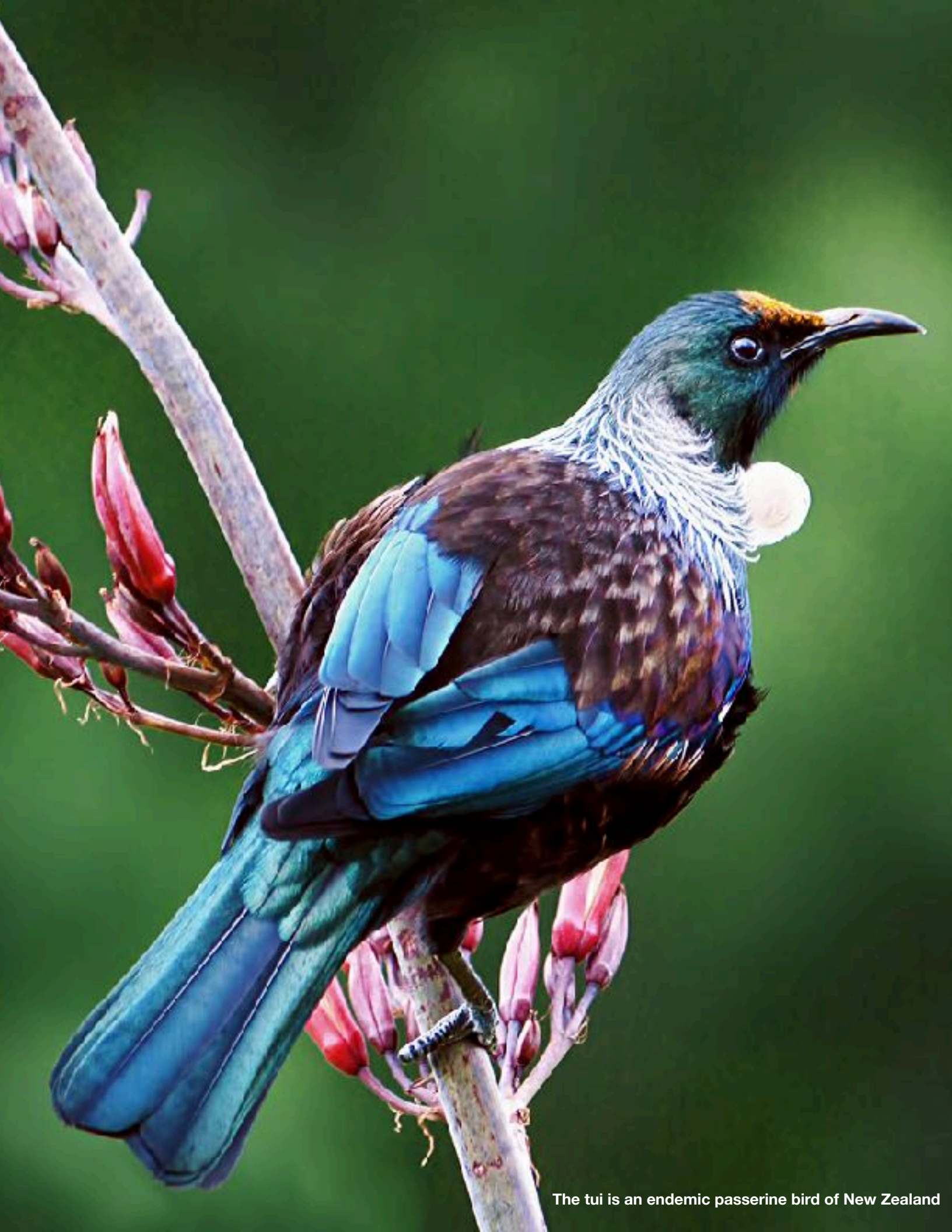
The tui is an endemic passerine bird of New Zealand